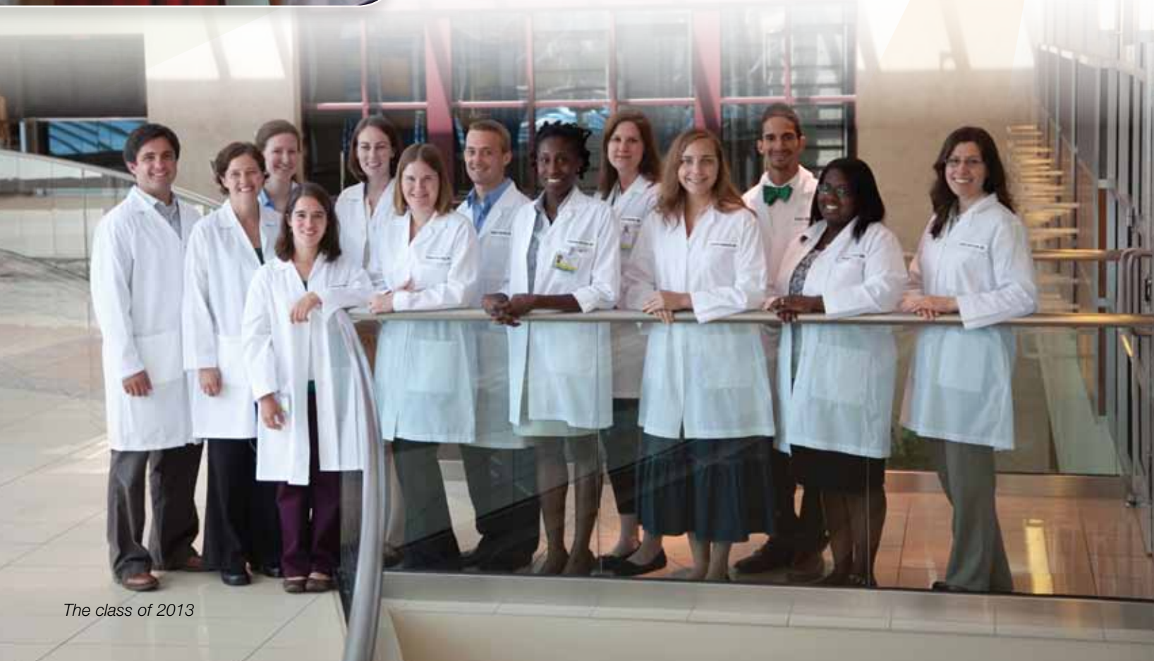
The class of 2013